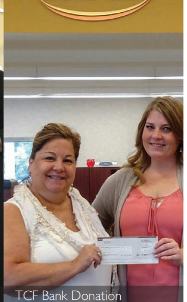
TCF Bank Donation