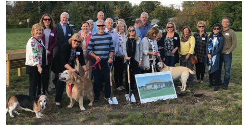
ARK Volunteers and Donors