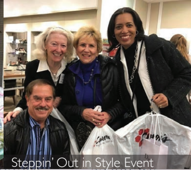
Steppin' Out in Style Event