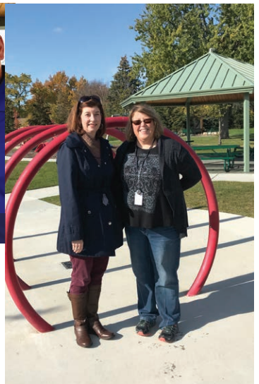
State Rep Cara Clemente