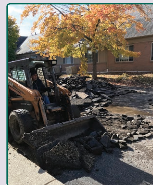
Much needed replacement of the First Step parking lot began December, 2017.