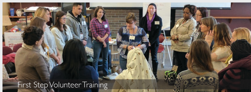
First Step Volunteer Training

At First Step, we understand how important it is to have volunteers on our team! In fact, we rely on you to help us create a strong support system for survivors in our community.