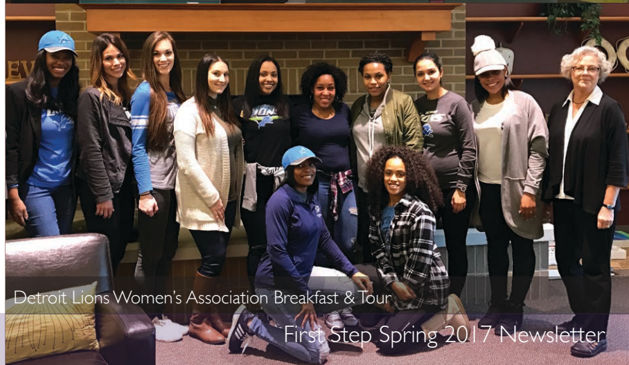
Detroit Lions Women's Association Breakfast & Tour