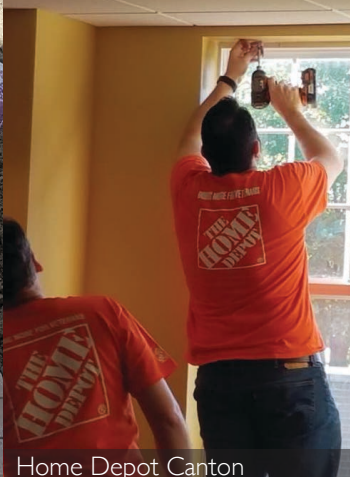
Home Depot Canton