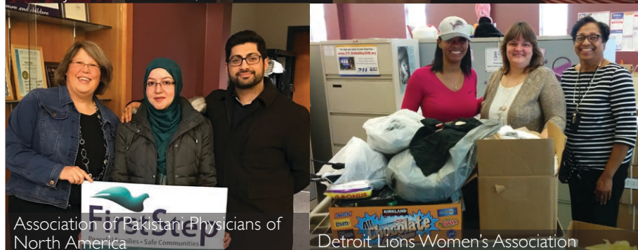
Association of Pakistani Physicians of North America