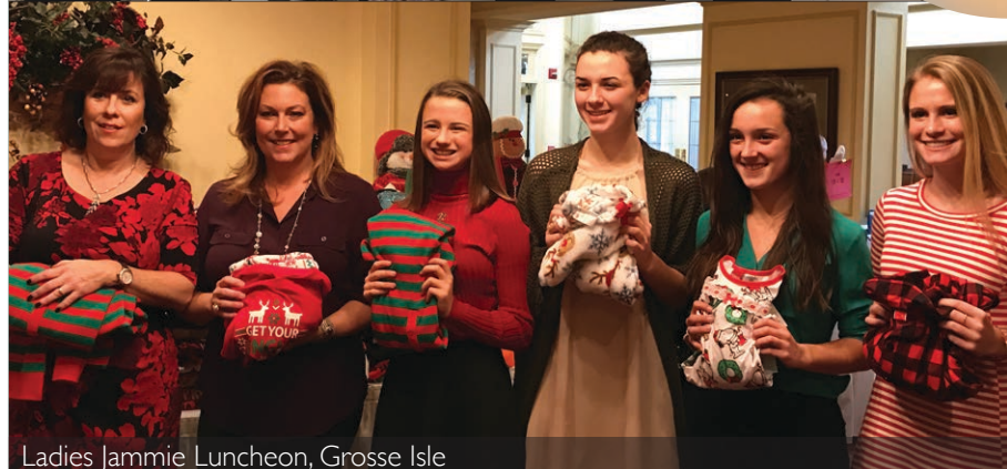
Ladies Jammie Luncheon, Grosse Isle