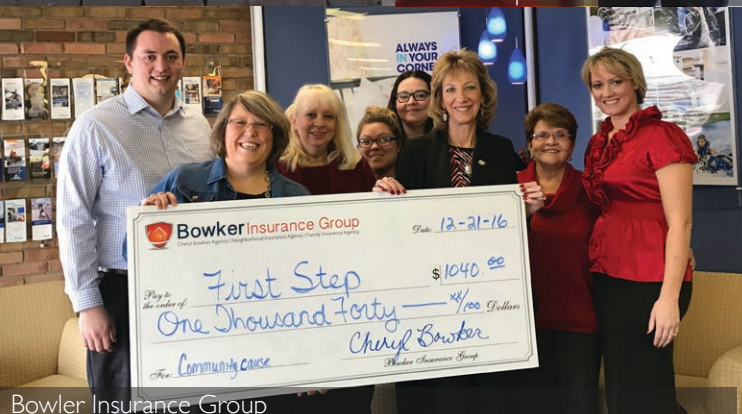
Bowler Insurance Group

Saturday, May 6, 2017 Sunday, May 7, 2017 Saturday, May 20, 2017 Sunday, May 21, 2017