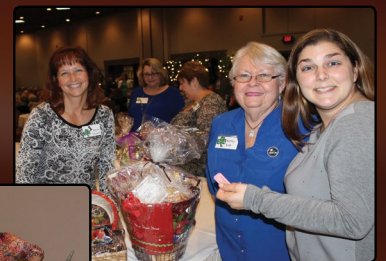
2015 CHOCOLATE AFFAIR

For tickets or more information, contact Barb Weir at 734-453-1459, or Pat Burba at 734-981-1702 or at laohelizabethfagan@hotmail.com .