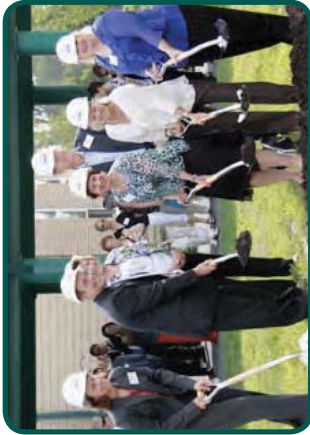
Campaign leadership and lead donors