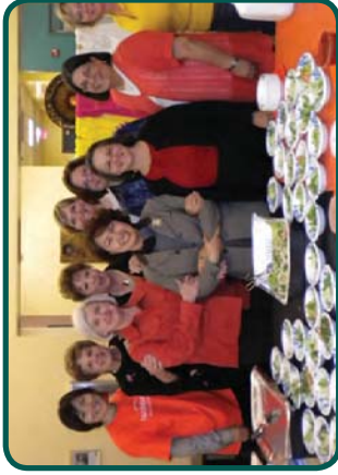
Zonta Club of Farmington-Novl volunteers