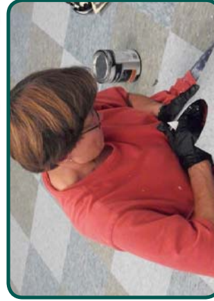
Divine Design Ministry dining hall make over