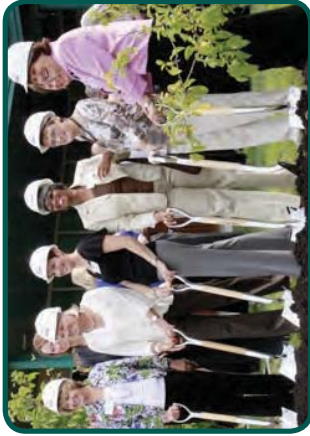
First Step board members breaking ground