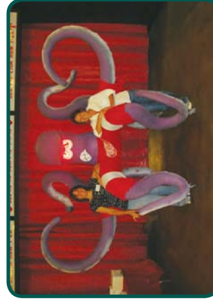
Chill at the Joe

HOCKEY GAME-ENFORCERS POLICE DEPARTMENT TEAM VS. RED WINGS ALUMNI COMMUNITY SHOWER FOR BUILDING OPENING I BELIEVE IN YOU VIDEO DMY AWARD WINNING DOCUMENTARY FILMED AT FIRST STEP MOVED FAMILIES FROM EXTENDED STAY OSMC DISCUSSION PANEL-RELIGION AND DOMESTIC VIOLENCE NEW ACCOUNTING SYSTEM WOMEN OF OAKWOOD EVENT UPONA TECHNICAL HIGH SCHOOL FASHION SHOW MAY 31ST RIBBON CUTTING-KAREN WILSON SMITHBAUER CENTER SANTA OTIS CONCERT BENEFIT PANCAKE BREAKFAST AND SURVIVOR ART SHOW TRANSITIONAL SUPPORTIVE HOUSING YEAR END CELEBRATION SUPPORT GROUPS NEW COMPUTERS FOR STAFF AND CLIENT AREAS JUDY ELLIS GIVEN ATHENA AWARD, WOMEN OF WESTLAND LACH CHOCOLATE AFFAIR CONSTRUCTED RESIDENTIAL WING MET SELECTS FIRST STEP AS CHARITY PARTNER DEMO OF OLD SHELTER PEACE